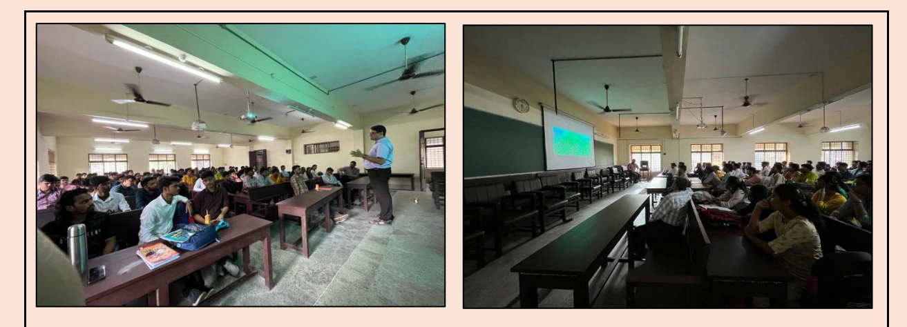
Faculties delivered talks as a part of the first-year orientation programme

The orientation programme for the First-year BTech Admits of 2022-23 was held in the Departments from 10 to 13 November 2022. Faculties from the institute delivered talks on various avenues and challenges faced by civil engineers. As a part of this programme, lab visits were also organized to introduce to the students the facilities available in the department.