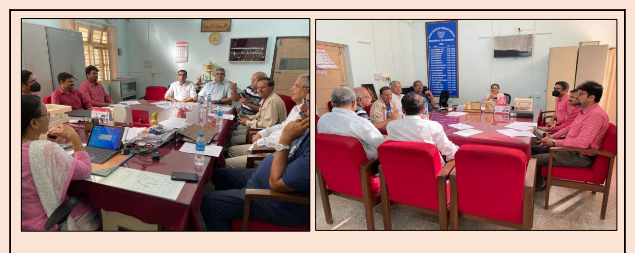
Faculty interaction with 1980 batch of Alumni

A few alumni members from the 1980 Civil Engineering batch visited the department on 22<sup>nd</sup> December 2022. They interacted with the faculties and provided feedback and suggestion about the programme based on their professional experience.