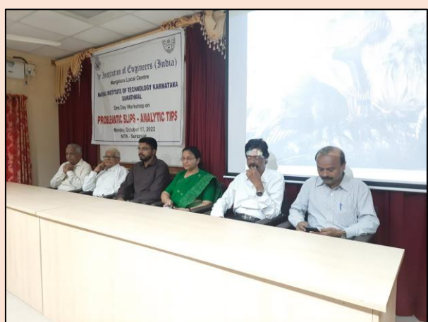
Inauguration of the one-day workshop on "Problematic Slips and Analytic tips" on 17th October 2022.